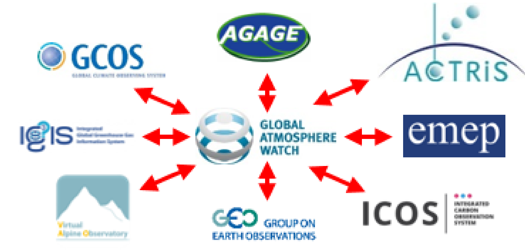
Selected programmes interacting with GAW

Specific programmes and projects do pioneer work with respect to new approaches, uncertainty estimation, or homogenization, improvement and consolidation of networks. A tight cooperation with those efforts ensures consistency with the GAW programme.