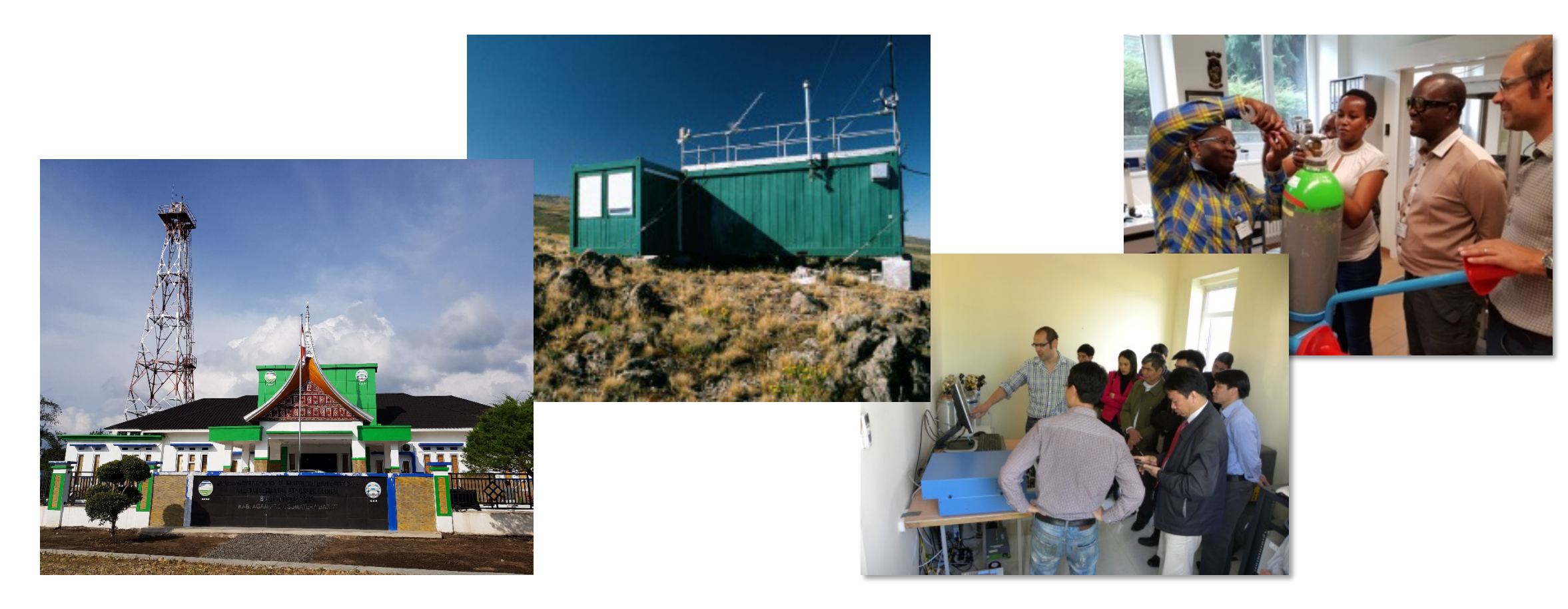
QA/SAC-CH's twinning stations and training

Twinning and support of GAW stations are core activities of QA/SAC Switzerland since the early beginning, initially devoted to only a few stations.